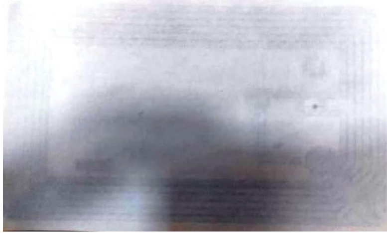
Fig 7. Working of RFID Chip at MRIMS.