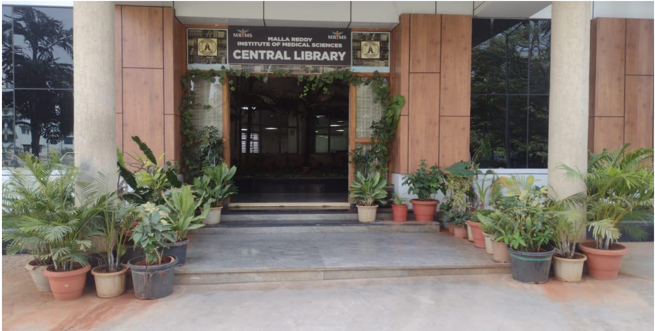
Fig 2. MRIMS Central library.

Although it is generally acknowledged that the core technology dates back to at least the Second World War, the history of RFID is surprisingly disputed. The most recent technology to be used in libraries for a combination of automation and security activities in the well maintenance of documents either inside the library or goes out of library is RFID, which was developed in 1969, patented in 1973, and first used in harsh industrial environments in the 1980s. The MIT Auto-ID Centre was established in 1999. The group was tasked with creating a universal standard for item-level tagging. The seminal paper by Harry Stockman was most likely the first work on RFID technology. Published in October 1948, "Communication by Means of Reflected Power" (Christoph J. 2013). One of the fastest growing automatic data collection (ADC) technologies, RFID uses wireless radio communications to uniquely identify people or objects. It consists of one or more reader/interrogators and RF transponders, with data being transferred using appropriately modulated inductive or radiating electro-magnetic carriers.