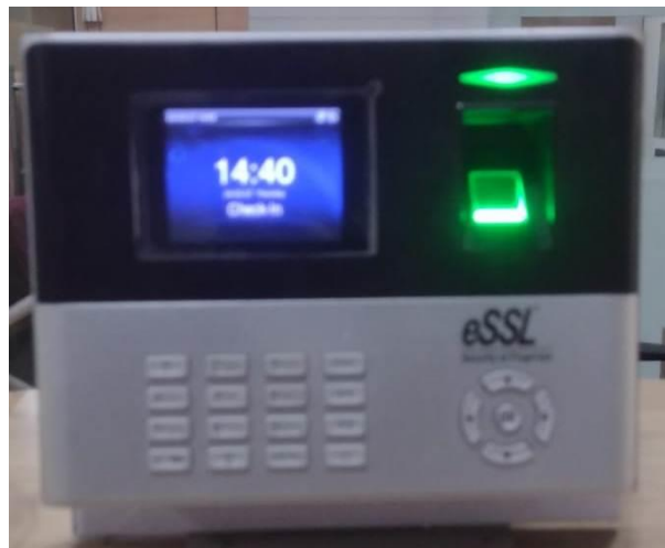
Fig 9. Students' bio metric registration desk at MRIMS central library.

As an illustration, tags can be used to hold information about a copy's depositary allocation, allowing a portable reader to quickly filter out the enumerated document. If the tags don't individually identify the book, they have a sticker with a stack of 3 bits of foil. By applying a magnetic field, the strips can be magnetized and no longer "ring" (radio) when pulsed by an external field. (The big coils next to the doors send out pulses and then have electronics listen for the radio signal of a not deactivated tag).