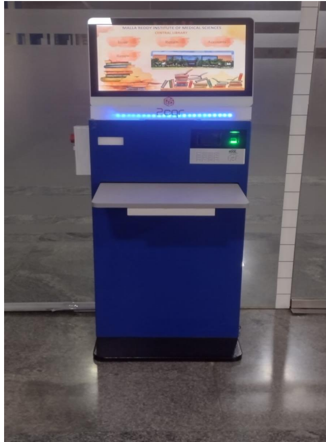
Fig 4. Self-service with Kiosk for issuing books to students.

The process of borrowing and tagging becomes simpler as a result of the anti-theft feature of the RFID label, which eliminates the requirement for an additional alarm strip to be connected to the object. This is user entry with biometric, attendance should be registered automatically; we can take the report periodically as Monthly, Quarterly and Yearly base.