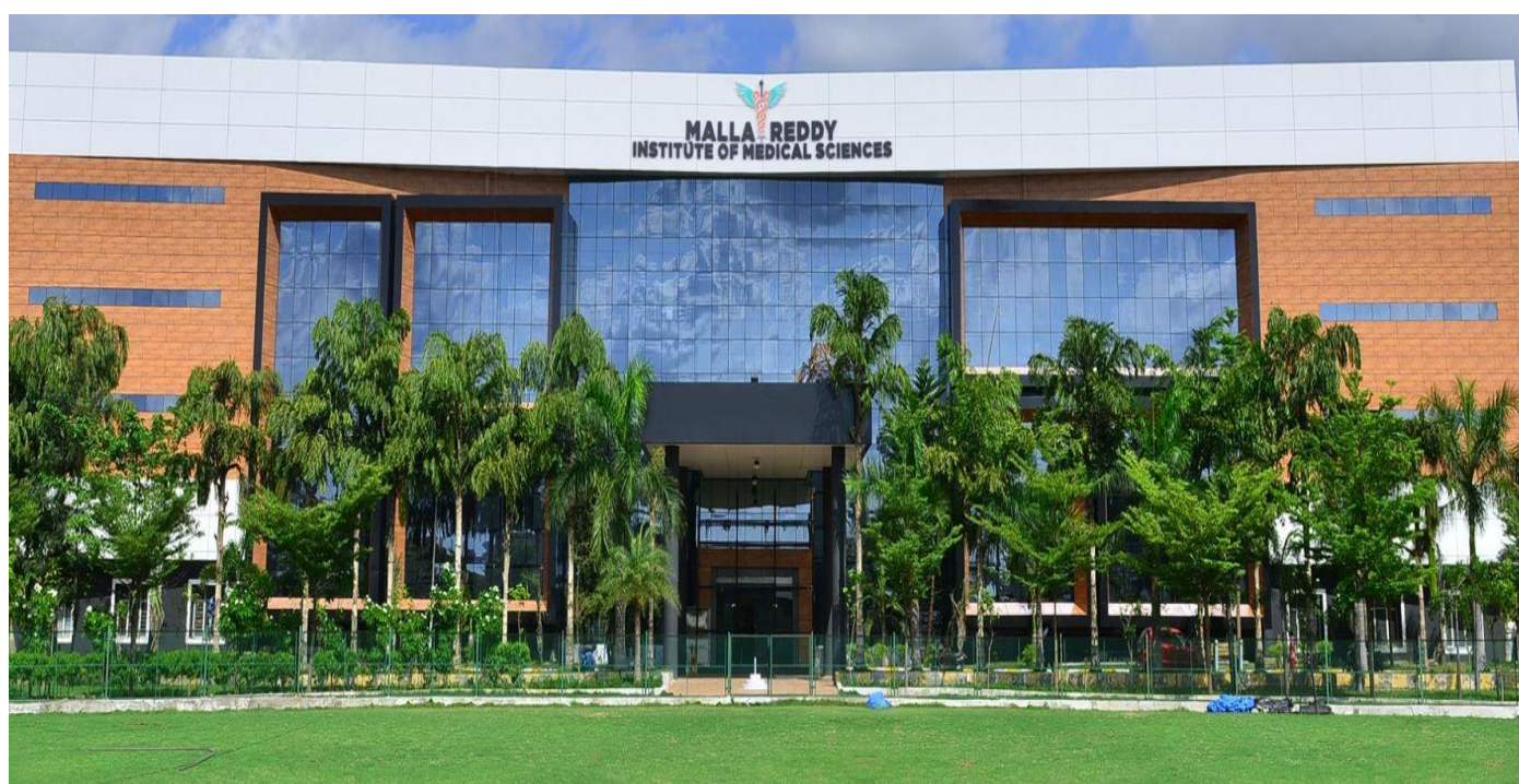
Fig 1. MRIMS campus overview.

The Institution accentuates the all round development of a student individually and as a group in both Academic and social and will not entertain the indiscipline regardless of gender in any circumstances.