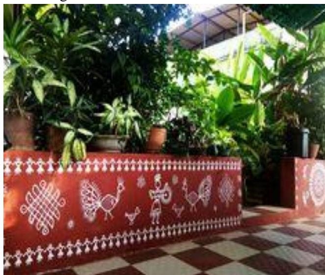
Figure 3. Folk art on wall

Talking about writing Graffiti, it had been considered vandalism earlier. But now the style adopted by today and popularity they met, many sponsors are adopting the medium as a tool for advertisement in the form of symbols and typography and social awareness as well as in political messages.