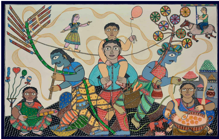
Figure 2. Painting on Socio Cultural expressions.

In the contrary context, the painting on the wall gives information and aesthetic, artistic expressions to the community by presenting public expressions. It defines the values, life, and traditions and prevalent socio-cultural issues also.