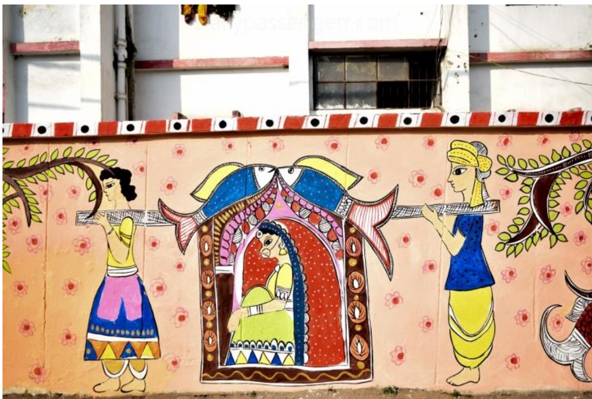
Figure 1. Art Forms

It is very often observed that a child scribbles on the walls of the room or teaches the class enacting a teacher at home and writes on the wall, considering it a black board or a smart board of today. Same is the case with Diego the famous mural artist of the day using the walls at home in his infancy. Michelangelo and Leonardo da Vinci's beautiful works are also admired throughout the world. So is the case with wall paintings of Kaimur range Uttar Pradesh, Bhimbetka in Madhya Pradesh and Ajanta, Ellora caves. All these evidences of the temples, roofs, walls, and interiors of the ancient places. Inscriptions on Charminar of Hyderabad represents the early graffiti writing on the walls.