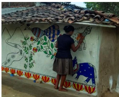
Figure 7 and Figure 8. Suktara Ghosh (2020), Picture on the wall