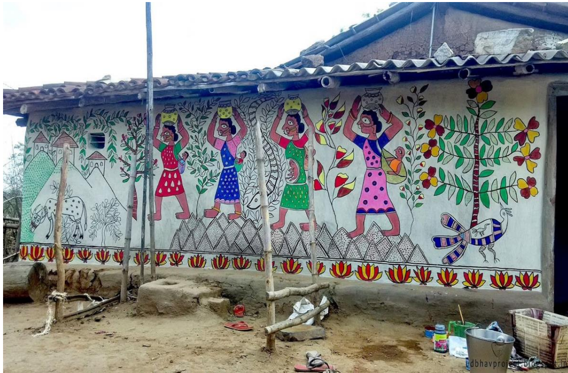
Figure 4. Patwardhan Aditi (2017). Madhubani murals on the walls of Jharkhand.

The murals, Wall paintings (smaller or larger) size are made as a tradition inside and outside the building, offices and public as well as private walls. They identify different tribes, religious beliefs, customs and project India for unity in her diversity. This way the local artists and art both are being encouraged. The messages, the theme, hand painted murals, serve different purposes at different places.