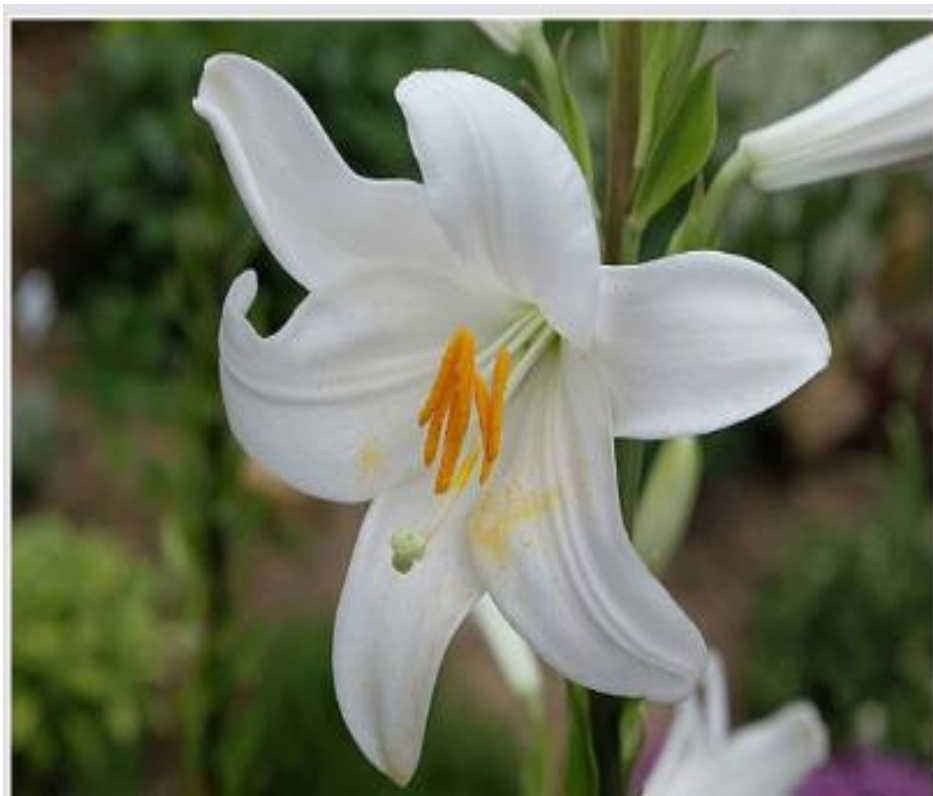
Figure 2- Flower of Lilium candidum L.[6]