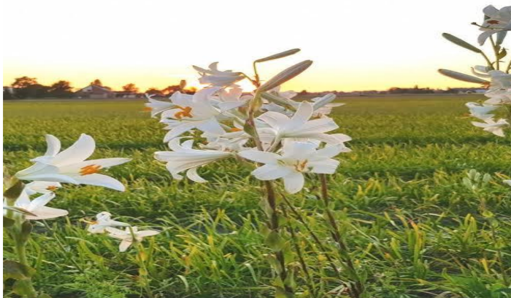
Figure 1- Plant of Lilium candidum L . [5]

The species Lilium candidum L is also called white lily, or white Madonna lily, which is well established for its traditional medicines which were widely used for the treatments of inflammations, burns, healing wounds and for ulcers in the extract of Lilium candidum L . On the basis of the hypothesis of the extract of the Lilium candidum possess the bio-protective activity due to correlations of anti-mutagenic activity of natural compounds with antioxidant effects and contents of phytochemical constituents from the flavonoids groups.[4]