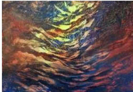
Fig. 3 - Him Chatterjee ' Blue Gorge ' Acrylic on canvas, 72x 48 Inches, 2010

Description- Here the artist has painted beautifully the Himalayan range. He has used beautiful used tones of blues, reds and yellows to depict the sun rise. by this we can see how much he is in love with the Himalayas. The sky has been treated very beautifully. Here, the bold strokes of the colors with painting knife are the hallmark of this painting.