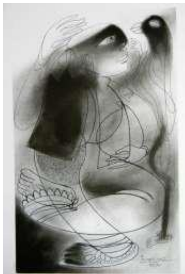
Fig.-5, Nand Lal Thakur " Conversation " Charcoal on paper, 14x11 inches, 2011, Source of image artist self-portfolio.