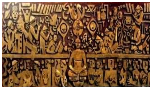
Fig. 4 - Him Chartterjee ' University ' mural, Source of the Image courtesy and image retrieved from website Him Chatterjee

Description- Here the artist has painted beautifully the Himalayan range. He has used beautiful used tones of blues, reds and yellows to depict the sun rise. by this we can see how much he is in love with the Himalayas. The sky has been treated very beautifully. Here, the bold strokes of the colors with painting knife are the hallmark of this painting.