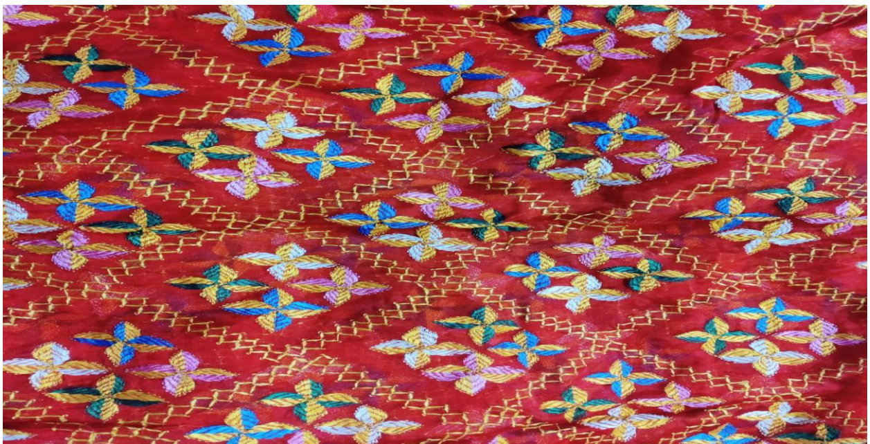
Fig.4.2 This Phulkari is from my mother's marriage[1994].