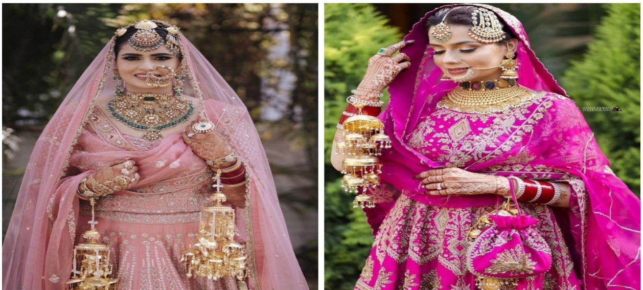
Fig.4.4 today's era bride 2022