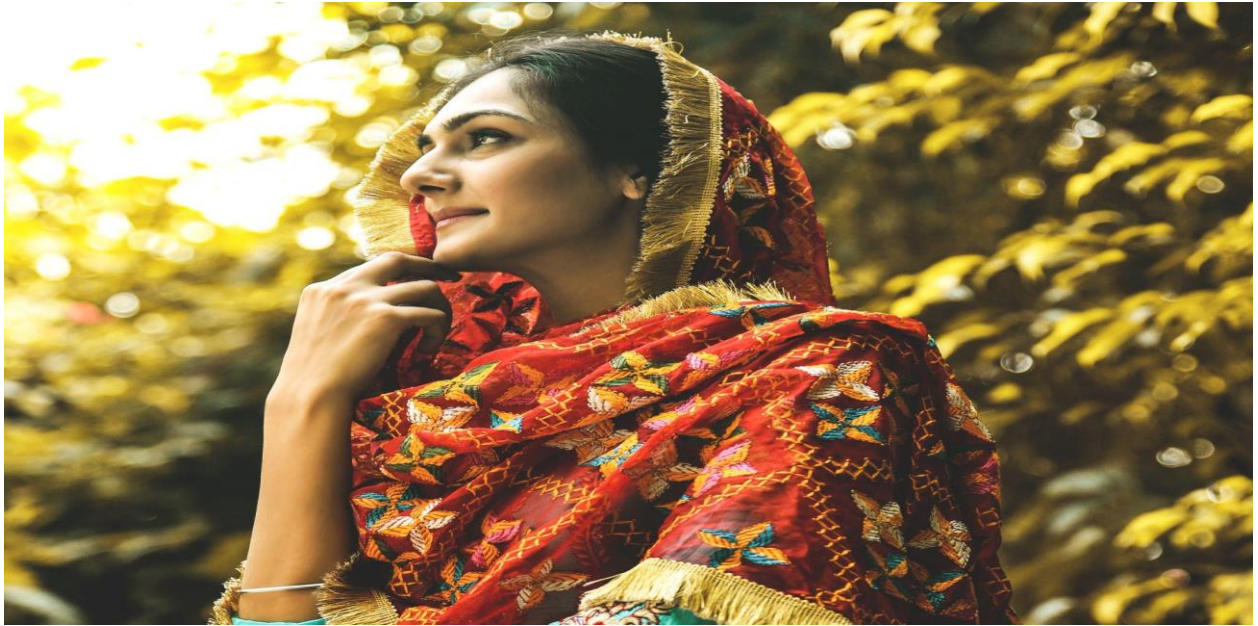
Fig.4.3 Mothers phulkari carried by her daughter in 2022.