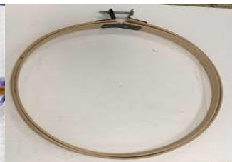
Fig.1.3 Wooden block