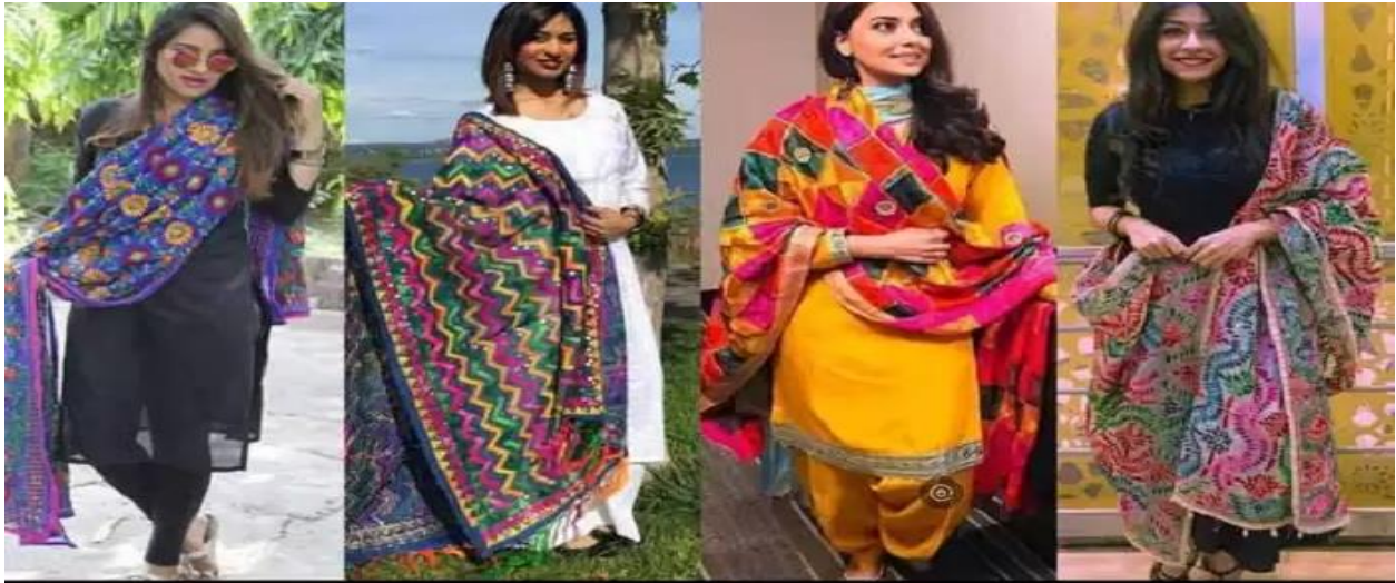
Fig.4.5 the motifs of contemporary era