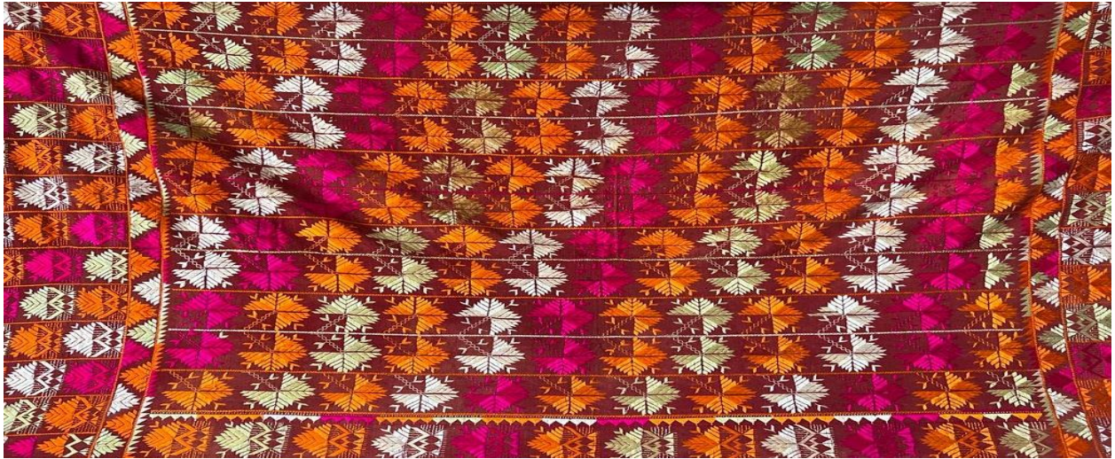
Fig.4.1 Baagh [Phulkari] of my Grandmother.[ Before Partition]

outfit style changed, or today's brides do not carry phulkari on their marriage even not on their Anand Karaj. Fig.4.5 Contemporary trend of wearing Phulkari , Today's generation has not embroidered Phulkari with their hand. That trend totally converted into machines or if they want hand embroidered they got from orders.