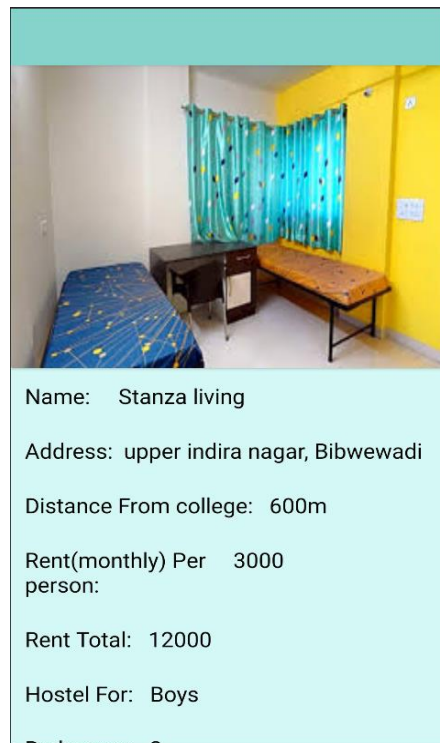
Fig. 2 : View hostel details

There have three modules in the application