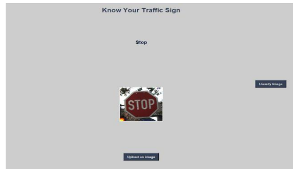
Fig 4: Stop