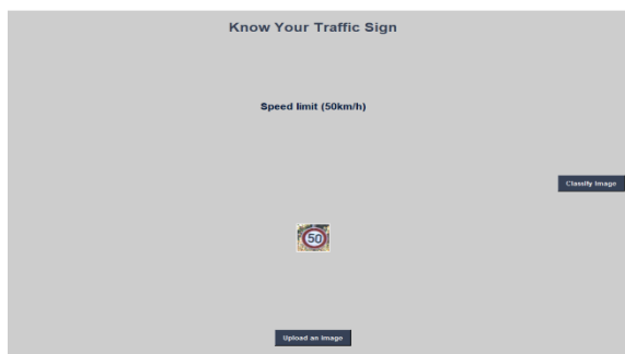
Fig 2: Speed Limit (50km/hr)

The captured images are inserted into the screen, the feature extraction, sign detection and classification is performed internally and then we are going to display the road sign with the description on the output screen as shown in the below images.