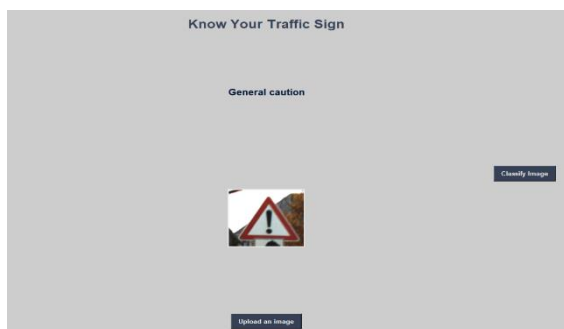
Fig 3: General Caution